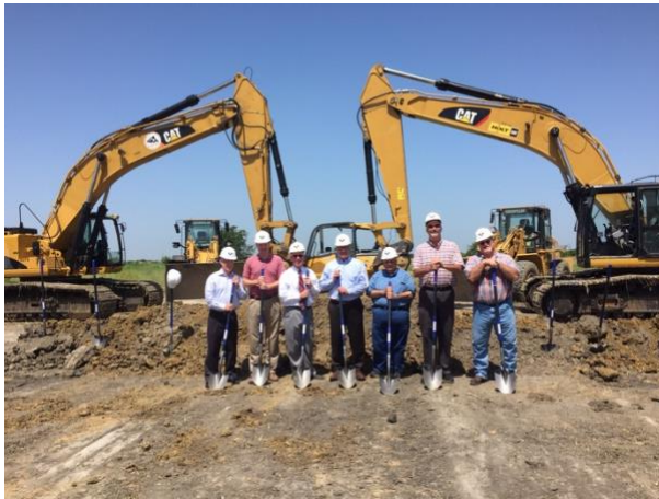
Image 3 MED Board Members & Staff at the park's groundbreaking

In April 2014, the MED purchased 212 acres for $2,060,000 along Hwy 67 and Miller Road to develop the Midlothian Business Park. The purpose of the park was to increase the amount of development ready sites for small/medium size industrial users and improve the quality of industrial development in Midlothian. It was believed that sights would range from 5-15 acre with buildings ranging in size from 20,000 to 150,000 square feet.