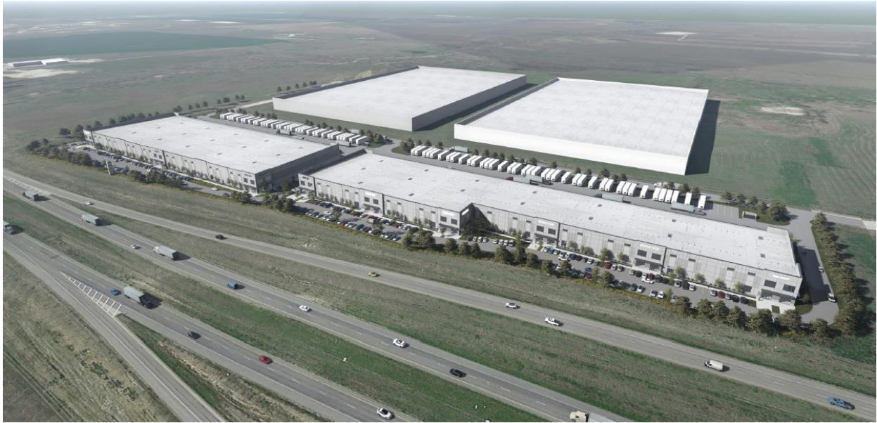
Image 5 rendering showing Provident Realty Advisors first two buildings with Sunrider building massing behind

buildings (184,406 and 159,543 square feet). Provident has leased 45,360 square feet and is finalizing two leases on an additional 184,406 square feet. Provident will submit building plans for their third building soon.