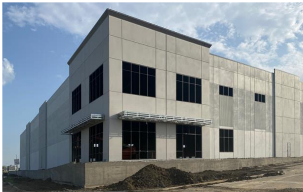
Image 6 Provident Realty Advisors 184,406 square foot building

The MED Board and City Council were ambitious in their undertaking of the Midlothian Business Park. It is noted by some that the project took longer than it should have or didn't play out exactly as planned, to others it will be seen as one of the greatest economic plays for Midlothian helping to welcome new manufacturers to our community and helping to set a quality of development that will continue to define Midlothian for decades.