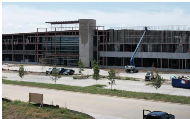
Image 4 Facade being installed on the Sunrider Manufacturing building

In January 2021, Arco Ventures closed on 6.5 acres and is currently constructing 100,149 square foot speculative industrial building. In October 2021, Provident Realty Advisors closed on 58 acres. Provident has just finishing the construction of two