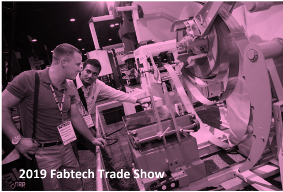
2019 Fabtech Trade Show